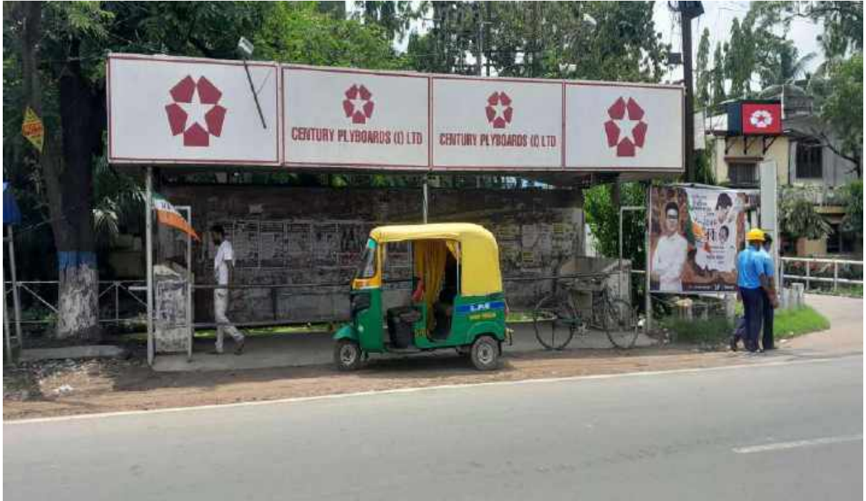
Photo: Bus-stand for local people