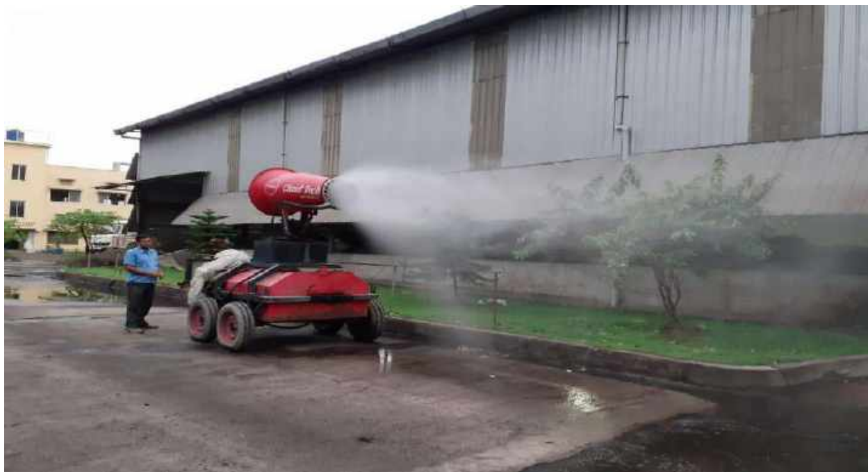
Photo: Water mist sprayer for proper cleaning of road