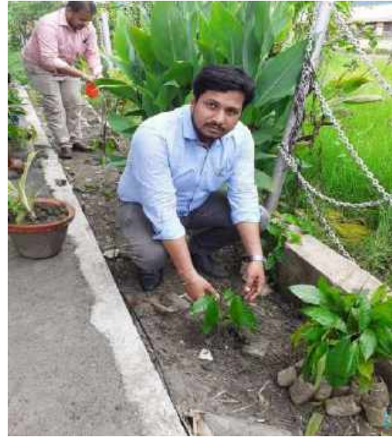
Photo: Mass plantation awareness and distribution of saplings