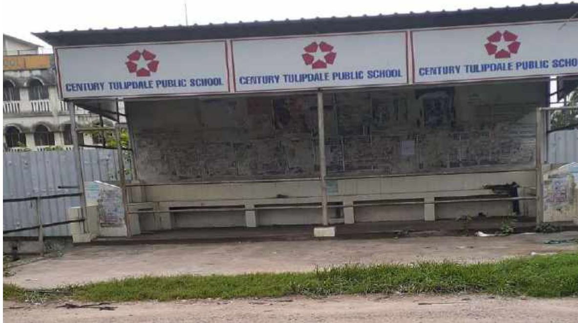
Photo: Bus stand for school children