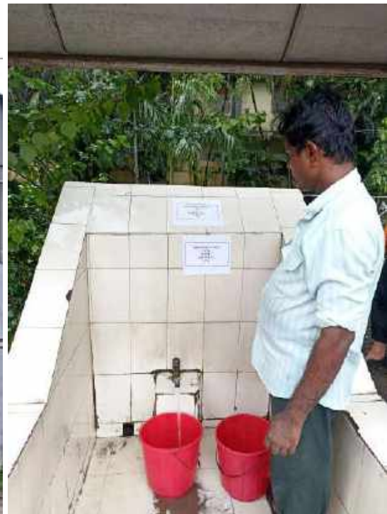
Photo: ATM and free drinking water station installed for local peoples