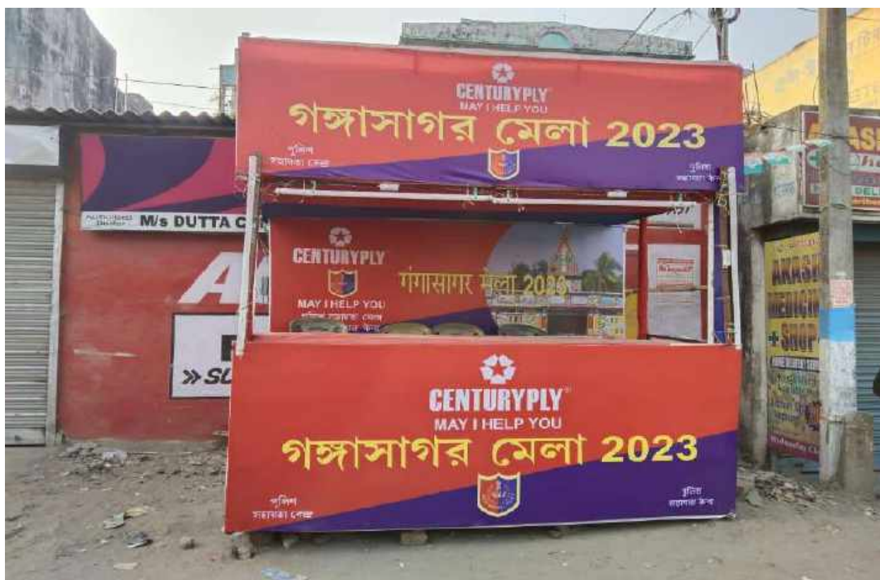
Photos: Police booths on DH road on behalf of Gangasagar Mela 2023