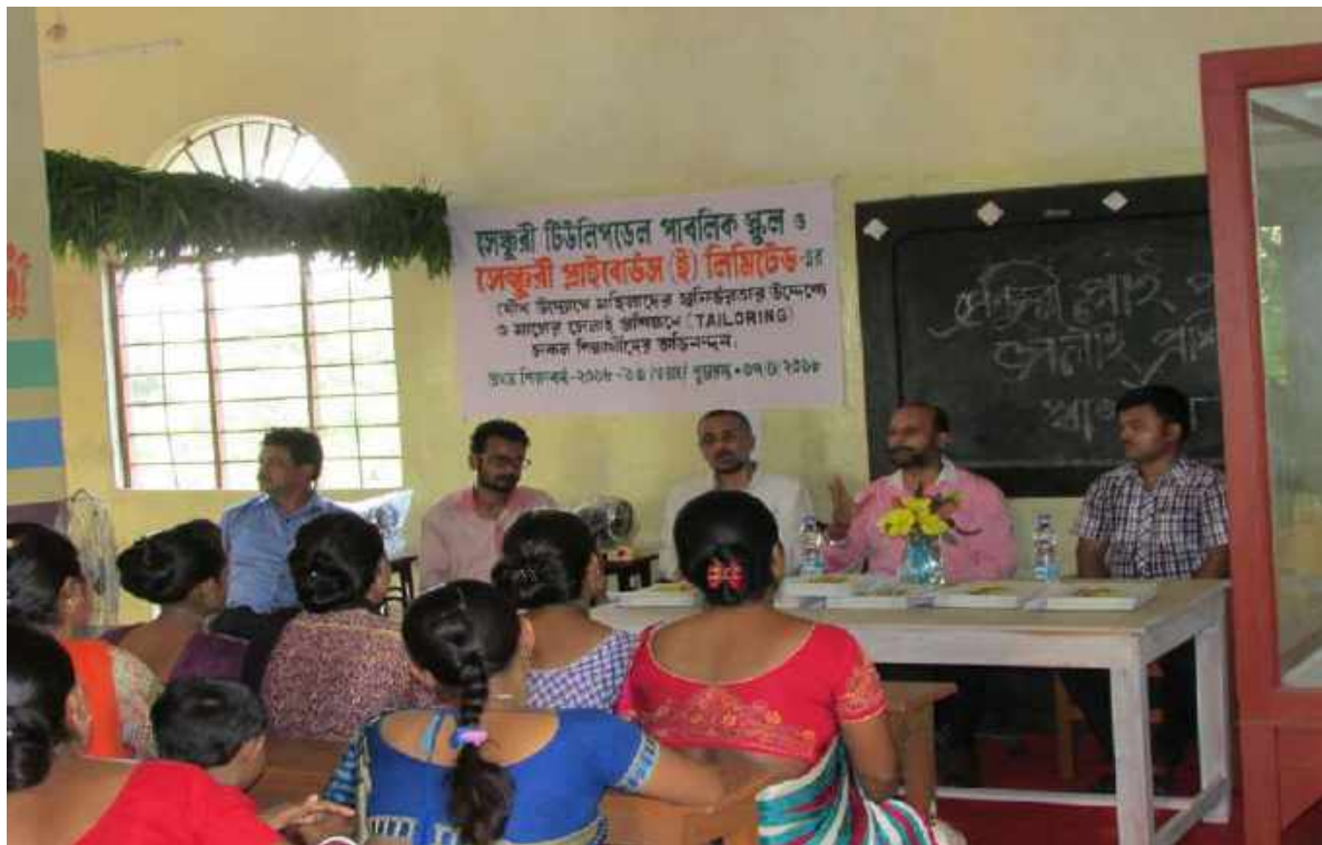
Photo: Free tailoring training to local needy women