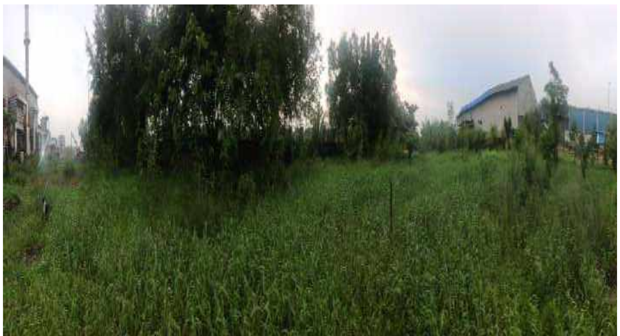
Photo: Greenbelt inside the plant