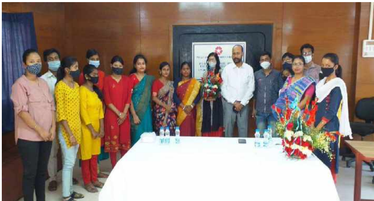
Photo: Free spoken English training to local needy students