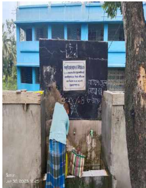
Photo: Free drinking water for local villagers